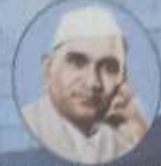
Karmaveer Bhau Sahab Hiray