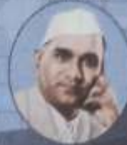
Karmaveer Bhausaheb Hiray