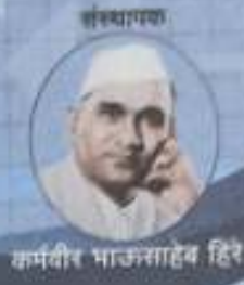
कर्मवीर बाजसाहेब हिरे